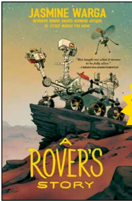
Art © 2022 By Matt Rockefeller