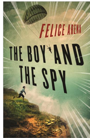
The Boy and the Spy by Felice Arena

An exciting, action-packed adventure set in 1854.