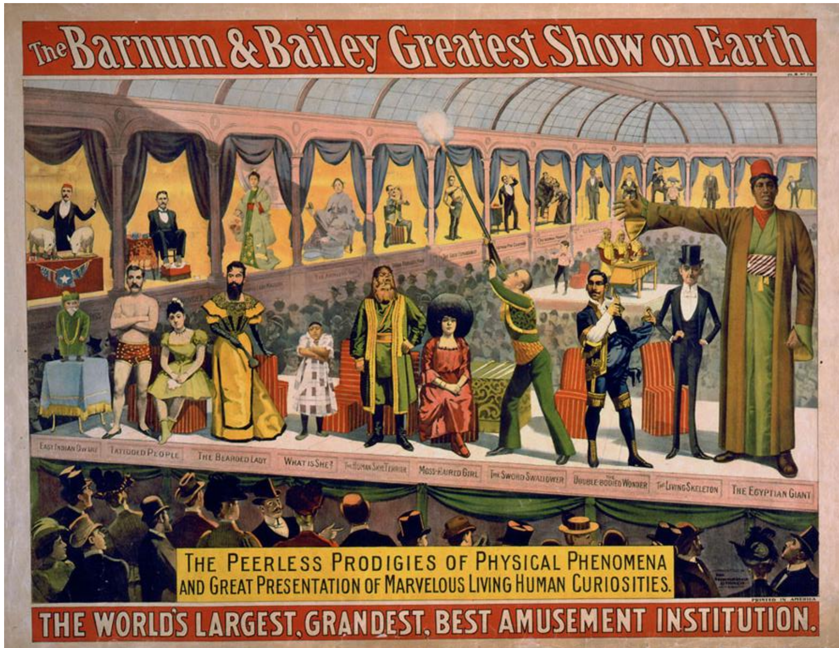
BLM 1 – Advertising poster