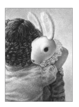
The rabbit's name was Edward Tulane, and he was tall. He measured almost three feet from the tip of his ears to the tip of his feet; his eyes were painted a penetrating and intelligent blue.