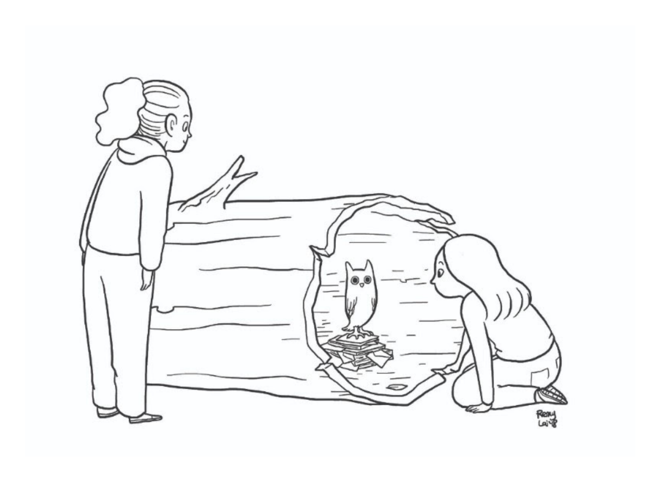
Printable design by Remy Lai