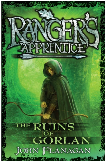
Ranger's Apprentice 1: The Ruins of Gorlan by John Flanagan

Will is small for his age, but agile and energetic. All his life, he has dreamed of becoming a great knight like the father he never knew, so he is devastated when he is rejected as an apprentice to Castle Redmont's Battleschool. Instead he is apprenticed to Halt, the mysterious Ranger whose uncanny ability to move unseen is thought to be the result of black magic. Reluctantly, Will learns to use a Ranger's secret weapons: a bow and arrow, a mottled cloak and a stubborn little pony. It may not be the sword and battlehorse he longs for, but when Will and Halt set out on a desperate mission to prevent the assassination of the King, Will finds that a Ranger's weapons are not so useless after all . . .