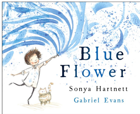
Blue Flower by Sonya Hartnett & Gabriel Evans

Why this story? Read another wonderful picture book by Sonya Hartnett with glorious illustrations by Gabriel Evans about finding beauty and difference in individuality. A story about self-esteem, resilience and the discovery that being different can be something wonderful.